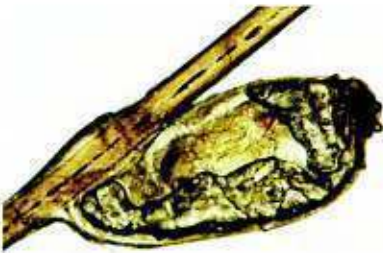
An unhatched egg is about 1 mm long by 0.3 mm wide

Eggs are tear-shaped and pin-head size. They are laid singly, firmly cemented to individual hair shafts where the warmth of the scalp will incubate them. Often they are located close to the hair roots. A head louse usually hatches 7 to 10 days after the egg is laid (sometimes 5 to 11 days).