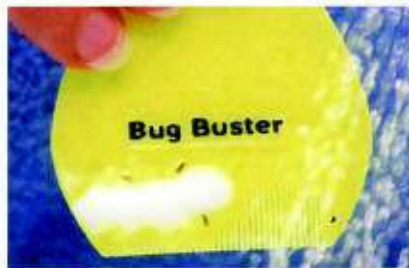
Rinsing lice from a Bug Buster comb

Oily products instead of conditioner This substitute is both inefficient and messy. Oil is liable to drip and stain, and requires extra shampooing to remove afterwards.