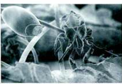
A live egg with a young louse on the head